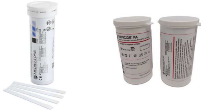
Left: Previous test strip bottle. Right: New test strip bottle.

There are no changes to the chemical formulation, instructions for use, packaging configuration, part number or other aspects of the product. Please continue to use Rapicide™ PA High-Level Disinfectant Test Strips in the same manner moving forward. A visual comparison is below for your reference.